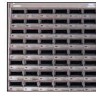
48 Lid** Max Density 3.65" x 1.12" x 1.01"