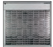
128 Compartments** High Density SBD II 2.36" x 4.48" x 0.88"

**due to the "U" shape design of the max density cover, the useable space is .78" x 1.01"