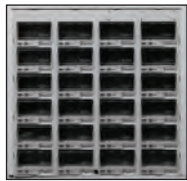
24 Lid High Density 4.96" W x 2.21" H