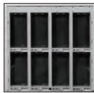
8 Lid Standard Density 4.96" W x 9.50" H