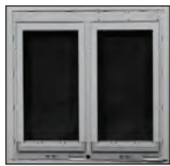
2 Lid Standard Density 10.83" W x 20.8" H