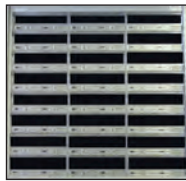
24 Long Lid** Max Density 7.48" x 1.12" x 1.01"