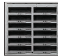
12 Lid Standard Density 10.8" W x 2.21" H