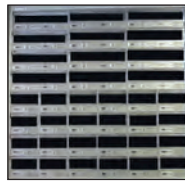
36 Lid** Max Density 24: 3.65" x 1.12" x 1.01" 12: 7.48" x 1.12" x 1.01"