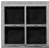
4 Lid Standard Density 10.83" W x 9.50" H