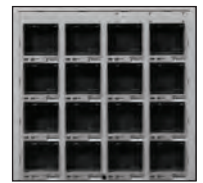
16 Lid High Density 4.96" W x 4.02" H